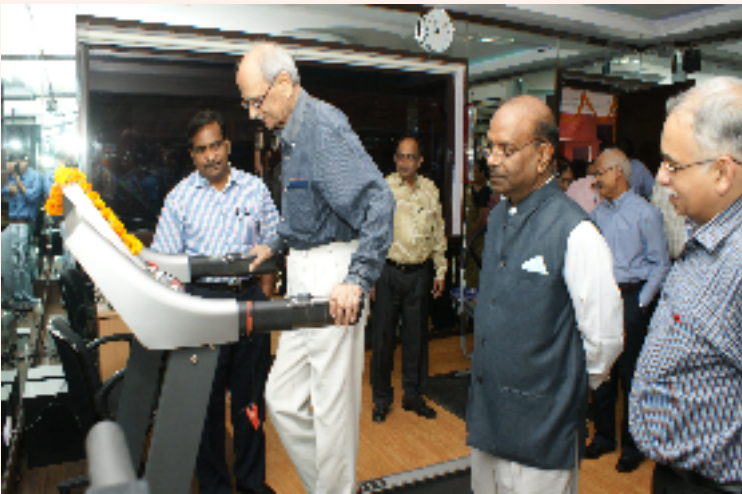
A well-furnished “VPCI Gym with Badminton Court” was opened for the staff and students of VPCI on 15 th September 2014.