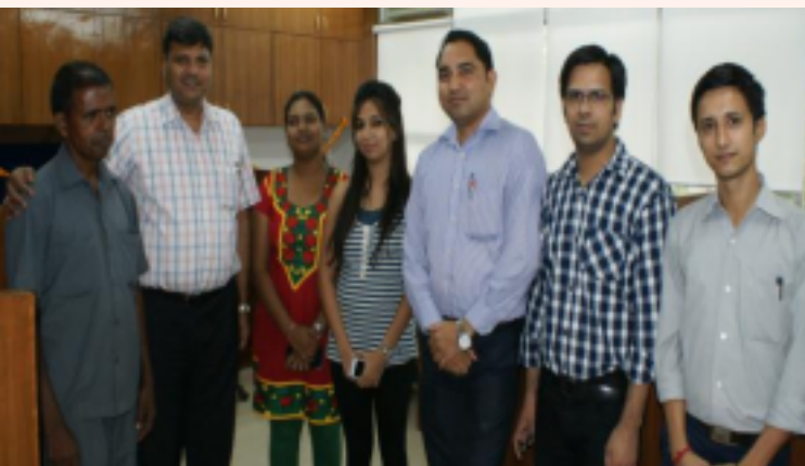
The renovation work of the Purchase Section was completed on September 2014.